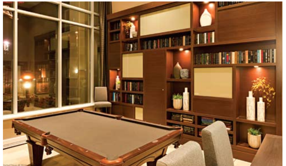
Perspectives homeowners can enjoy a game of pool or perhaps, borrow a must-read book from the building’s chic billiards library.

The new homes – 215 tower homes and eight townhomes – range in size from 713 square feet to 1,345 sq. ft. and start from $310,900. Visit www.ledmac.com for details.